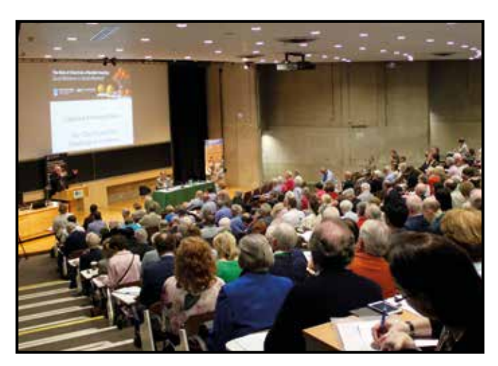
A packed audience at the conference